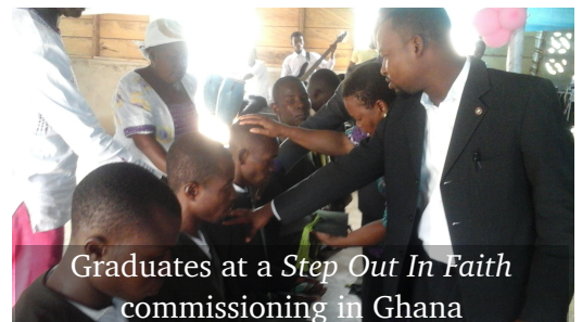
Graduates at a Step Out In Faith commissioning in Ghana

In practice, the ministry operates under the name Step Out In Faith but as Trustees we are trustees of Suzanne’s Ministries , for it is under that name that we are known to the Charity Commission.